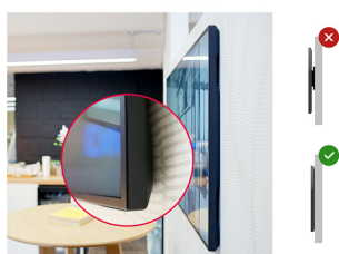
Zero-Gap Wall Mount

Designed to perform in continual, around the clock environments, the LH5070UHB can be installed and utilised in landscape and portrait orientation. The jaw dropping and best-in-class 30mm total depth (when used with the included proprietary brackets) will mean this display can be installed discreetly and elegantly in all areas.