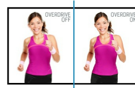
OverDrive ON / OFF

The infrared technology uses infrared backlight. A touch event is registered with great accuracy when the infrared light is blocked by finger or stylus. This technology does not rely on an overlay or substrate, so it is impossible to physically "wear out" the touchscreen. Moreover the display characteristics remain virtually unaffected by the touch functionality.