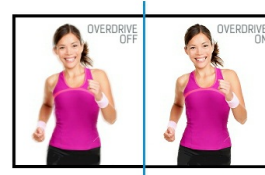
OverDrive ON / OFF

The infrared technology uses infrared backlight. A touch event is registered with great accuracy when the infrared light is blocked by finger or stylus. This technology does not rely on an overlay or substrate, so it is impossible to physically "wear out" the touchscreen. Moreover the display characteristics remain virtually unaffected by the touch functionality.