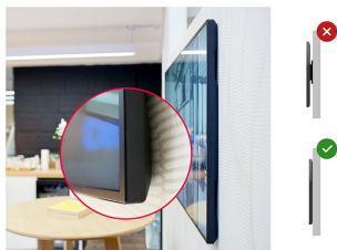
Zero-Gap Wall Mount

Designed to perform in continual, around the clock environments, the LH5570UHB can be installed and utilised in landscape and portrait orientation. The jaw dropping and best-in-class 35mm total depth (when used with the included proprietary brackets) will mean this display can be installed discreetly and elegantly in all areas.