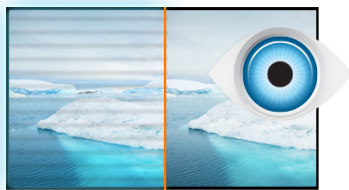
Flicker-free + Blue light

The ProLite B2483HSU is an excellent 24" Full HD LED-backlit monitor with 1920 x 1080p resolution. It features 1ms response time and 80 000 000 : 1 Advanced Contrast Ratio, assuring clear and vibrant picture quality and high contrast. Triple input support ensures compatibility with the latest installed graphics cards and embedded Notebook outputs. The ergonomic stand offers 13 cm height adjustment with pivot, swivel and tilt, making this screen suitable for a wide range of applications and environments where workplace flexibility and ergonomics are key factors. The monitor is TCO and Energy Star certified. A perfect solution for education, local government, business and finance markets.