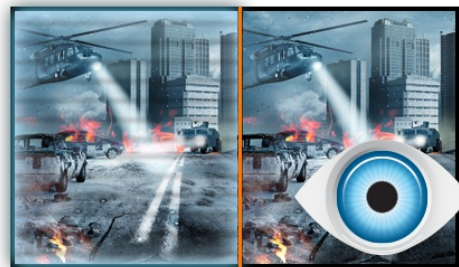
Flicker-free + Blue light

VA panel technology offers higher contrast, darker blacks and much better viewing angles than standard TN technology. The screen will look good no matter what angle you look at it.