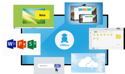
iiWare 8.0 (Android OS)

Share, stream and edit content from any device directly on screen and transform your team meetings or lessons into an easy, fast and seamless interactive session with the included WiFi module (OWM001) and the ScreenSharePro app.