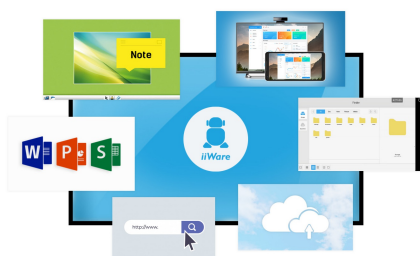
iiWare 8.0 (Android OS)

Share, stream and edit content from any device directly on screen and transform your team meetings or lessons into an easy, fast and seamless interactive session with the included WiFi module ( OWM001 ) and the ScreenSharePro app.