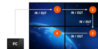
Daisy Chain Support

Thanks to Android OS, you can easily customize the display to your needs by installing applications directly to it.