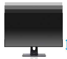
Height Adjustable Stand

With true WQHD 2560 x 1440p resolution your monitor is ready to display high definition images. This means you can accommodate more information on your screen, i.e. over 76% more in comparison to a 1920 x 1080 monitor.