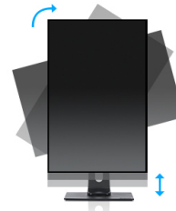
HAS + Pivot

IPS displays are best known for wide viewing angles and natural, highly accurate colours. They are especially suited for colour-critical applications.