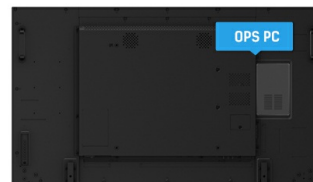
OPS PC SLOT

IPS technology offers higher contrast, darker blacks and much better viewing angles than standard TN technology. The screen will look good no matter what angle you look at it.