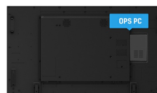
OPS PC SLOT

IPS technology offers higher contrast, darker blacks and much better viewing angles than standard TN technology. The screen will look good no matter what angle you look at it.