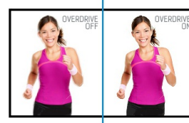
OverDrive ON / OFF

Controlling the monitor's brightness through electric current has allowed us to eliminate the screen flicker. You can easily test it yourself – just look at the screen via you smartphone's camera. Your eyes will love it.