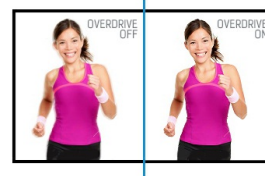
OverDrive ON / OFF

Controlling the monitor's brightness through electric current has allowed us to eliminate the screen flicker. You can easily test it yourself – just look at the screen via you smartphone's camera. Your eyes will love it.