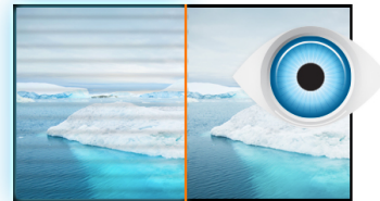
Flicker-free + Blue light

VA panel technology offers higher contrast, darker blacks and much better viewing angles than standard TN technology. The screen will look good no matter what angle you look at it.