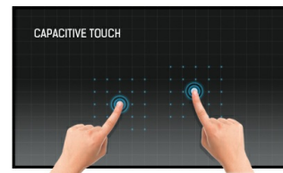
Touch technology - Capacitive

IPS displays are best known for wide viewing angles and natural, highly accurate colours. They are especially suited for colour-critical applications.