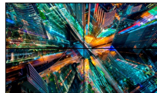
Ultra Slim Line

IPS technology offers higher contrast, darker blacks and much better viewing angles than standard TN technology. The screen will look good no matter what angle you look at it.