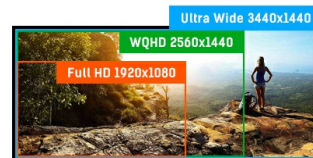
ULTRA WIDE - UWQHD

IPS displays are best known for wide viewing angles and natural, highly accurate colours. They are especially suited for colour-critical applications.