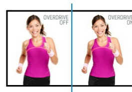
OverDrive ON / OFF

IPS displays are best known for wide viewing angles and natural, highly accurate colours. They are especially suited for colour-critical applications.