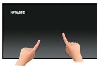
Touch technology - Infrared

ProLite TH5563MIS is a 55" Full HD professional, feature-rich and robust LED-backlit display with touch functionality (infrared - 6 compatible touch points) and AG Coating. The Anti Glare coating is used in professional-grade displays to help avoid issues with reflections and external light sources affecting colour reproduction, contrast and sharpness. It also makes the screen less susceptible to dust, grease and dirt marks. Incorporating the latest Commercial Grade 120Hz IPS panel technology, the display guarantees great viewing from all angles, high brightness and exceptional colour clarity. It also features an ambient light sensor delivering optimal picture quality with the added benefit of saving on power. The display supports PIP, a video-wall function and incorporates a wide range of video and audio inputs which ensures compatibility with multiple platforms. ProLite TH5563MIS will suit a wide range of applications including Interactive Signage, Retail, Exhibitions, Kiosks, Educa