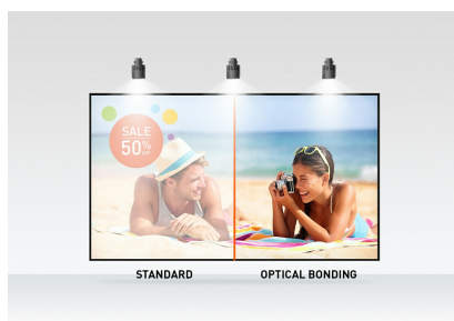
Optical bonded PCAP

The ProLite T2752MSC-B1AG with its Full HD (1920x1080) resolution and with IPS panel technology offers exceptional colors and wide viewing angles. The Optical Bonded Projective Capacitive (PCAP) 10-point touch technology ensures a seamless and accurate touch response and a lower light reflection, in addition, the display is protected against humidity and potential moisture development. A special Nano coating ensures a smoother touch and less resistance in the swipe. It makes the screen less static and susceptible to dirt, dust and fingerprints. The flexible stand can be positioned at several angles creating a comfortable and ergonomic user experience and the integrated cable management system hides all the cables and electrical wires giving a neat and cable-free workspace. The Anti Glare coating helps to avoid issues with reflections and external light sources affecting colour reproduction, contrast and sharpness. A perfect choice for a vast array of applications.