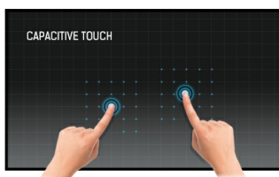
Touch technology - Capacitive

The ProLite TF3215MC-B2AG uses PCAP Touch technology and is built into an eye-catching bezel with edge-to-edge anti-glare coated glass drastically reducing ambient reflections in high-brightness environments without compromising the sharpness and clarity of the image. The rugged bezel equipped with a foam seal finish supports seamless integration into kiosks and provides IP65 rating resulting in dust and water resistance from the front making it perfect for high use public facing applications. Landscape and portrait orientation ensures flexible mounting possibilities in almost any installation. The TF3215MC-B2AG is the ideal solution for kiosk integrators, industrial environments, control rooms and interactive multimedia.