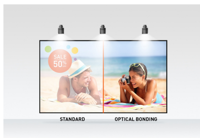
Optical bonded PCAP

Available also in black : ProLite T2752MSC-B1