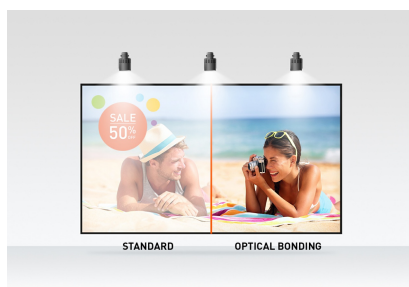
Optical bonded PCAP

The Full HD (1920x1080) Open Frame monitor ProLite TF2438MSC-B1 with IPS panel technology offers exceptional colors and wide viewing angles. The Optical Bonded Projective Capacitive (PCAP) 10-point touch technology ensures a seamless and accurate touch response and a lower light reflection, in addition, the display is protected against humidity and potential moisture development. A robust metal housing and a scratch-resistant 7H edge-to-edge glass with anti-fingerprint coating make the monitor particularly suitable for integration in demanding environments. The monitor meets also a IPX1 protection rating, making it waterproof for a period of time against dripping water. The ProLite TF2438MSC-B1 can be used in landscape, portrait and face-up orientation. A perfect solution for kiosk systems, retail and interactive digital signage installations.