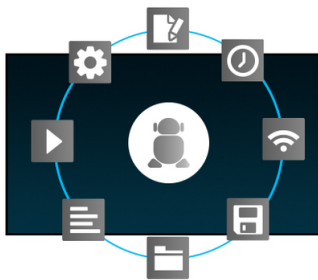
Android İşletim Sistemi

This ELED VA display consumes significantly less power compared to DLED IPS while maintaining the same level of brightness. Its versatile orientation, sleek design, and 24/7 reliability ensure it seamlessly integrates into any business environment. Whether it's used in retail, corporate, hospitality, or educational settings, the LH5560UHS -B1AG will undoubtedly captivate your audience and leave a lasting impression.