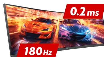
180Hz & 0.2ms MPRT

The Fast IPS panel technology guarantees not only high-fidelity, vivid battleground scenes displayed with outstanding colour accuracy but provides also an outstanding 0.2ms Moving Picture Response Time (MPRT).