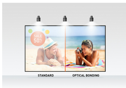
Optical bonded PCAP

The flexible stand can be positioned at several angles creating a comfortable and ergonomic user experience and the integrated cable management system hides all the cables and electrical wires giving a neat and cable-free workspace. The ProLite T2238MSC-B1 can be used in landscape, portrait and face-up orientation. A perfect solution for interactive signage, instore retail, POS and interactive presentations.