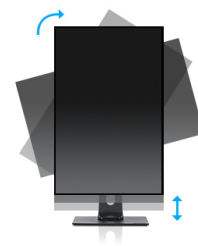
HAS (150mm) + PIVOT

A typical CCFL LCD uses four backlight lamps. Using LED diodes considerably lowers the power consumption and reduces the CO 2 emission into the environment making this LCD a true ECO-Friendly product.