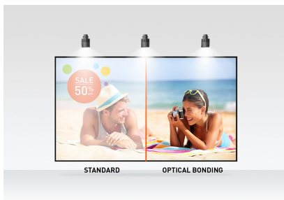
Optical bonded PCAP

The Full HD (1920x1080) Open Frame monitor ProLite TF2238MSC-B1 with IPS panel technology offers exceptional colors and wide viewing angles. The Optical Bonded Projective Capacitive (PCAP) 10-point touch technology ensures a seamless and accurate touch response and a lower light reflection, in addition, the display is protected against humidity and potential moisture development. A robust metal housing and a scratch-resistant 7H edge-to-edge glass with anti-fingerprint coating make the monitor particularly suitable for integration in demanding environments. The monitor meets also a IPX1 protection rating, making it waterproof for a period of time against dripping water. The ProLite TF2238MSC-B1 can be used in landscape, portrait and face-up orientation. A perfect solution for kiosk systems, retail and interactive digital signage installations.